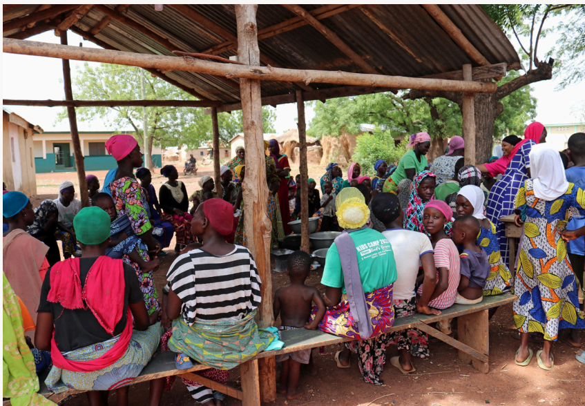
Women's gathering in the village of Kpatchelo, Ghana

With your support we spent time in villages and taught women how to make soap and start a business and earn an income to help support their families in Ghana. We also spent time in a Christian orphanage and loved on the children! Thank you!